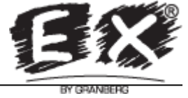
Vibration-reducing work gloves EX®

Macro Skin Pro® with Velcro closure, unlined